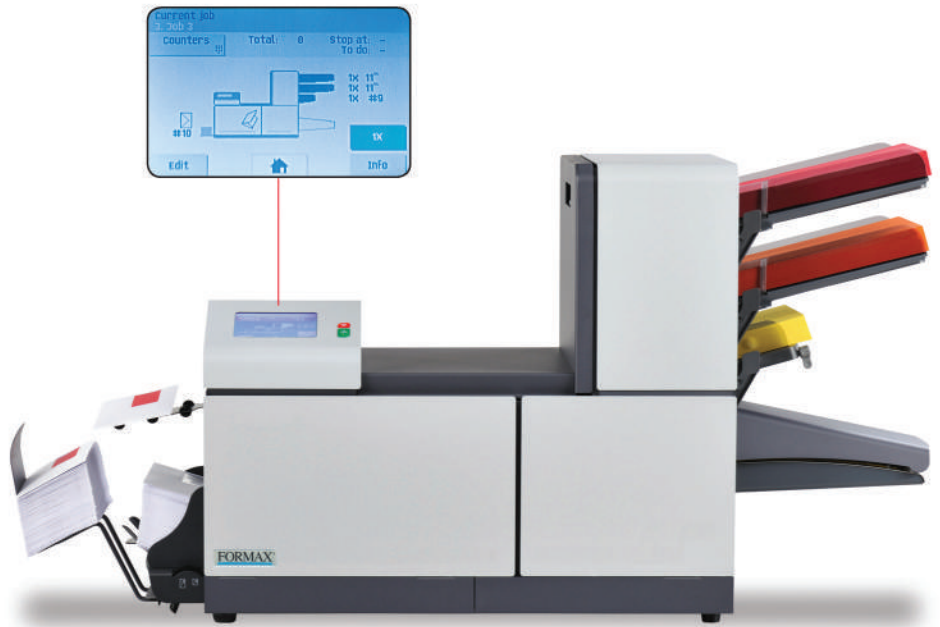
FD 6204-Advanced 2