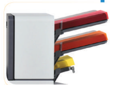
2 sheet feeders and 1 insert/BRE feeder