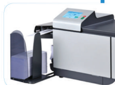
Optional side exit tray