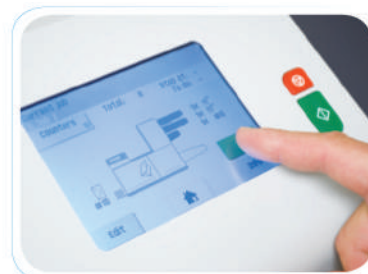
User-friendly color touchscreen control panel

* Paper & envelope specifications may vary. All media must be tested.