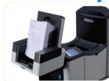
High-capacity Vertical Stacker holds up to 500 filled envelopes