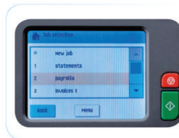
User-friendly full-color touchscreen control panel

* Paper & envelope specifications may vary. All media must be tested.