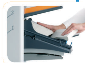
Optional Production Feeder holds up to 325 BRES