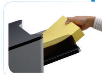
High-capacity Document Feeder holds up to 725 sheets and multi-page sets